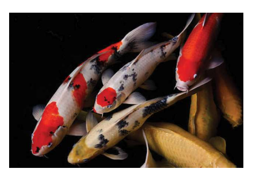
Koi carp fishes