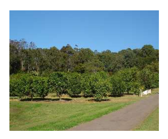
Figure.10.1. Photo images of protected cultivation (A) and open-air cultivation (B).